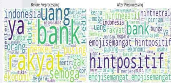
Figure 1. Wordcloud

Specifically visible. After preprocessing, wordcloud shows significant changes, where the words appear become more structured and informative, such as banks, people, money, credit, and economy. This shows that the preprocessing stage succeeds in reducing noise, uniting word variations, and improving the quality of text representation so that the topics discussed in the data become clearer and more relevant. In the context of text classification, high-frequency words influence the TF-IDF weighting process because they contribute to feature formation within the vector space representation. Although TF-IDF reduces the dominance of overly common terms through inverse document frequency weighting, words that consistently appear within specific sentiment classes can still provide strong discriminatory signals, the image of the WordCloud result can be seen in Figure 1.