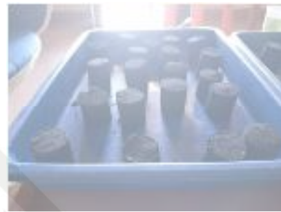
Figure 3. Coconut Dregs Briquettes Biomassa Burning

the briquettes because the less water content the briquettes have, the better they are.