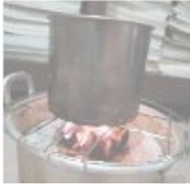
Figure 5. Briquette Testing Using Biomass Stove