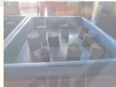
Figure 4. Coconut Dregs Briquettes Direct Burning