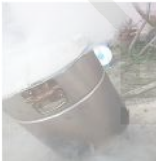
Figure 2. Making Coconut Dregs Directly

This direct burning uses a container as a burning place. 500 grams of coconut dregs were used. This direct burning does not use fuel to burn the coconut dregs but burns the coconut dregs directly in a burning container. After the coconut dregs are burned, the burning container is covered so that no air from outside enters. The burning continues until the coconut dregs become charcoal. It can be seen in the following