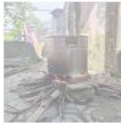
Figure 1. Burning Coconut Dregs by Biomass