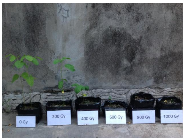
Figure 1. Effects of gamma rays on the seedling growth of Kipas Putih Soybean at 14 th day after germination

The decline number of survival plants can be seen clearly in this study. The plants still survive even though only 30 -50 % at 200 - 400 Gray doses. In the mutagen treatment at a dose of 600-1000 Gray, most plants were only able to germinate until they released cotyledon leaves, no growth occurred at the next stage. One month after planting, all plants in this treatment died (Figure 1).