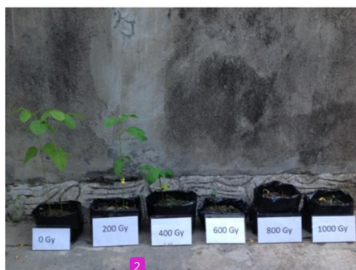
Figure 1. Effects of gamma rays on the seedling growth of Kipas Putih Soybean at 14 th day after germination

The decline number of survival plants can be seen clearly in this study. The plants still survive even though only 30 -50 % at 200 - 400 Gray doses. In the mutagen treatment at a dose of 600-1000 Gray, most plants were only able to germinate until they released cotyledon leaves, no growth occurred at the next stage. One month after planting, all plants in this treatment died (Figure 1).