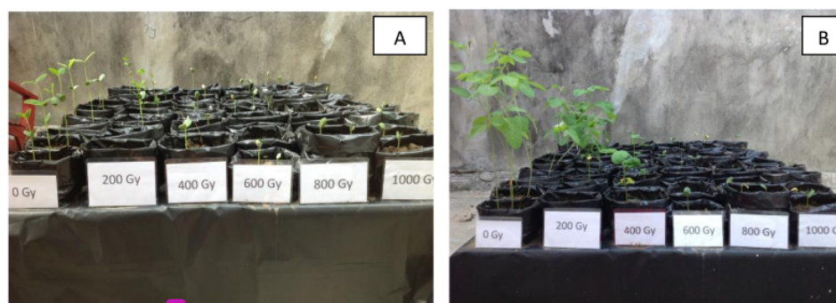
Figure 3. Effects of gamma rays on the seedling growth of Soybean ( Glycine max L.) cv. Kipas Putih A. at 7 th day after planting; B. at the 14 th day after planting

The present study revealed that the seedling height decreased progressively as the doses of mutagens treatment increased at 7 th , 14 th and 21 st days after planting (Figure 2). Seedling height was maximum in control than the mutagenic treatment. The reduction in seedling height on 21 st day varied from 47.4 cm (0 Gray) to 2.2 and 2.6 cm (800 Gray, 1000 Gray). The highest seedling height reduction was observed at 600, 800 and 1000 Gray treatment. There are many early reports on dose depended reduction on seedling height in soybean given by [16,17]. A reduction in seedling height can be attributed to the inhibition of growth due to low rate of cell division, decreased amylase activity and increased peroxide activity.