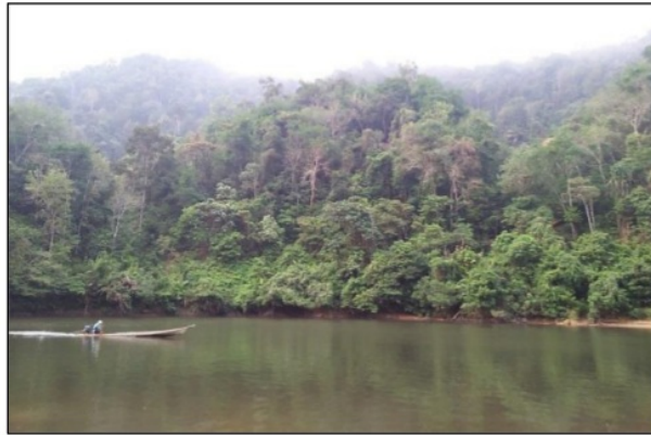
Figure 1. Hutan Larangan area at the research location.

together with traditional leaders agreed on the prohibition forest covering an area of 300 hectares that cannot be use and destroyed.