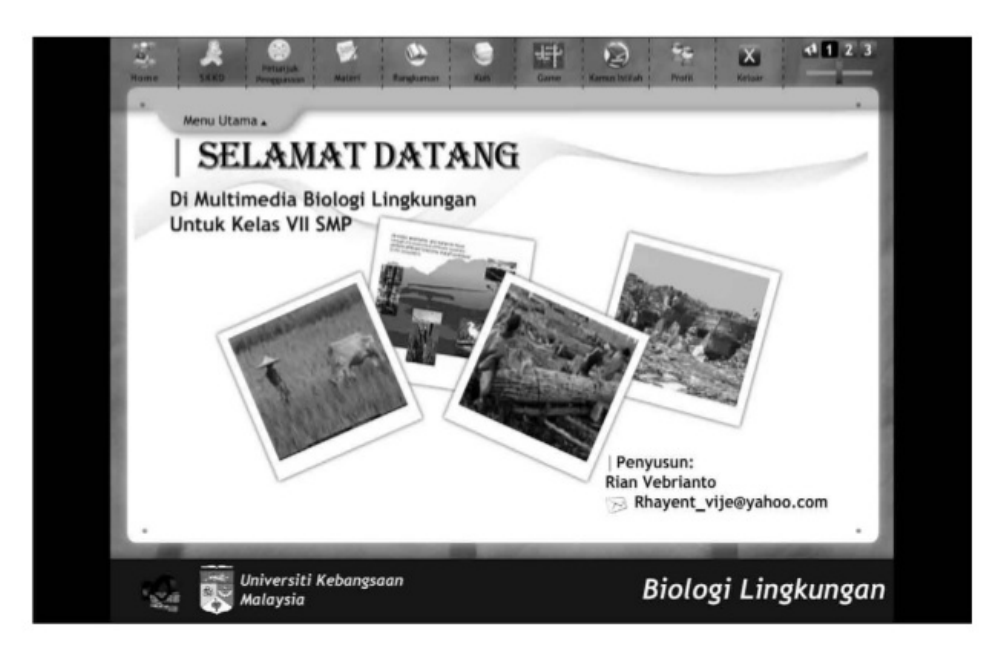
Figure 2: Main menu.

The content structure for the development of the environment based module is shown in Figure 3 below. On the other hand, the second experimental group underwent truly environmental learning experience while the control group learnt the same topic using conventional teaching methodology.