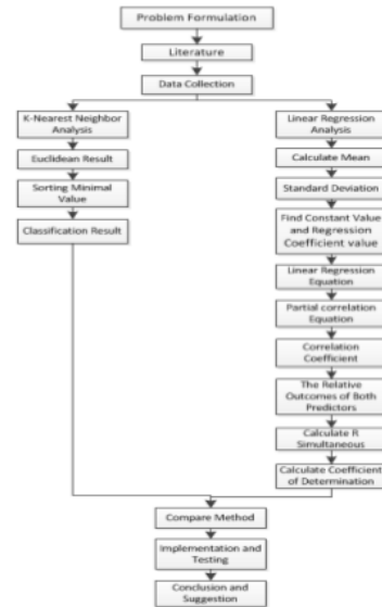
Fig. 2. Stages of Research Methodology

Regression. The differences and similarities of both methods are investigated to find the variables that serve as a benchmark comparison between the two methods. As a result, comparable variables are defined as viz. accuracy, precision, recall, absolute error, classification error, and RMSE value. A literature review is studied through various sources and references from books or e-books, articles, national and international journals and proceedings. The data collection by Provincial Government of Riau in 2013 and 2014 consisted of 8,212 data.