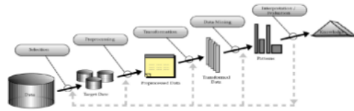
Fig. 1. Stages of Knowledge Discovery in Database –KDD[11]

The last stage is to form the data mining pattern as a form of interpretation/evaluation. Herein, the Linear Regression method and K-Nearest Neighbors method are applied.